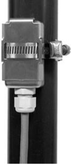
DFS-II Doppler Sensor with Pipe Clamp

The DFS-II flow sensor installs without cutting the pipe. It takes just a few minutes to mount on the outside of any pipe. The switch/electronics enclosure can be mounted 20 ft (6 m) away from the sensor (optional up to 500 ft / 152 m) to simplify wiring to pumps, alarms, valves or other equipment.